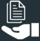
EXPANDING TREATY NETWORK